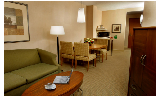
SUITE LIVING ROOM